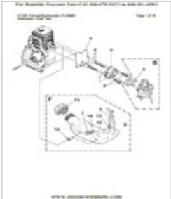
Diagram S And Or Partslist S

Read online diagram s and or partslist s now available in our site. Free download diagram s and or partslist s also accesible right now..